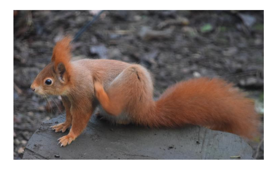
Mortality, post mortem and histological studies

It is strongly recommended that all deceased red squirrels be sent for a comprehensive post-mortem examination by a veterinary pathologist with relevant experience. Even if bodies are not fresh, samples can be used for viral research. Examination should include direct microscopy during the post-mortem examination itself. Samples collected during the examination should include a complete set of formalin-fixed tissues for histology and appropriate fresh samples for parasitology and microbiology. Routine retention of a set of frozen (ideally ultra-frozen) tissues (liver, spleen, lung, kidney, brain and gut content) is desirable. Faecal screening for adenovirus by transmission electron microscopy and PCR testing is recommended in all suspicious acute deaths. Diagnosis is not straightforward from gross post-mortem examination alone, particularly if the carcass is autolysed. In these circumstances, the additional option of hair selection as an analytical matrix for PCR analysis may be of particular benefit, as internal organs may not be available for analysis. The findings should be shared with the studbook keeper so that managers can record the findings and, where necessary, inform the studbook members.